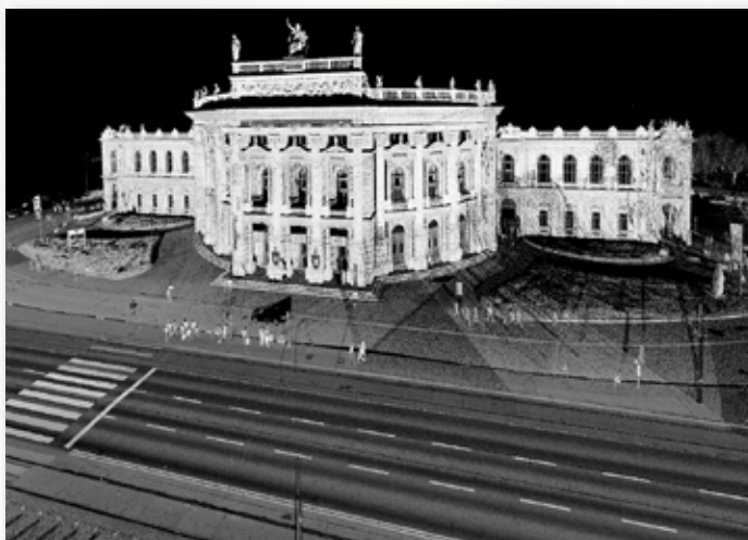
High Resolution City Modeling