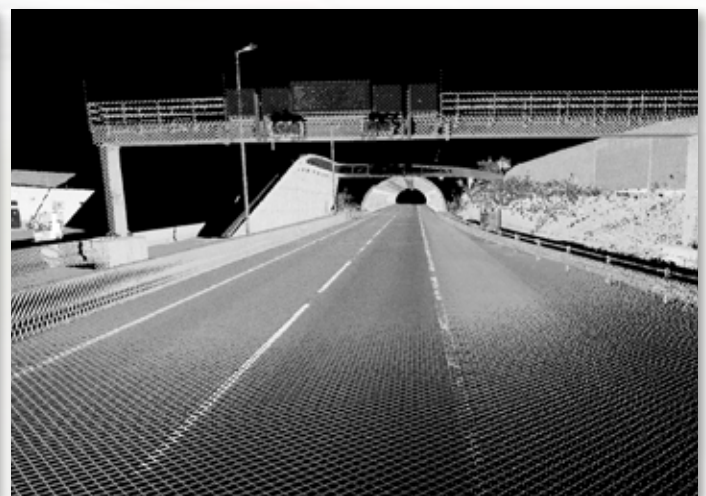
Transportation Infrastructure Mapping at highway speed