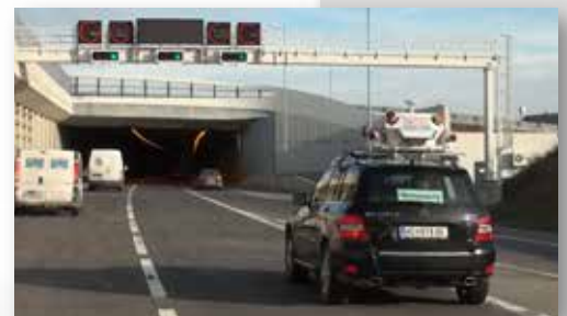
RIEGL VMX-1HA Highway Mapping