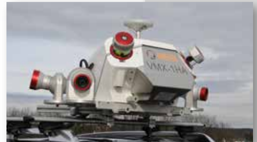
RIEGL VMX-1HA with (2x) 5 MP and (2x) 9 MP cameras

The optional VMX-CS6 camera solution supports triggering of up to 6 cameras for precisely time stamped image capture. A wide range of cameras can be used with the system including 5-megapixel and 9-megapixel cameras, the POINT GREY Ladybug5 spherical imaging system as well as high resolution DSLR cameras up to 36-megapixel.